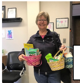
Cross County Community School Family and Consumer Science students stopped by the office to donate items to fill Easter baskets for the children we serve!